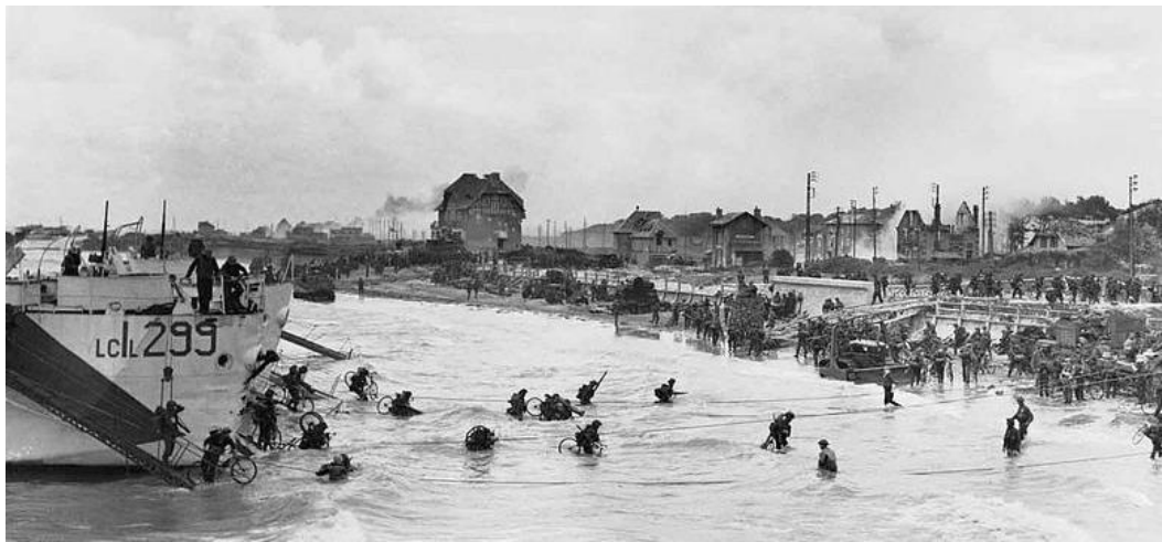
Canadian troops disembarking at Bernières - Juno Beach.

Two full days of sightseeing in Normandy. Among the highlights will be Pegasus Bridge; Juno Beach (the Canadian sector of the Landing Beaches) with the excellent Juno Beach Centre in Courseulles-sur-Mer; the Canadian War Cemetery of Bénvy-sur-Mer; Arromanches with the remains of the great artificial ‘Mulberry’ harbour; and Ardenne Abbey, where Canadian POWs were executed by SS troops. Also, Bretteville Canadian War Cemetery in the area of the Falaise Gap; Caen, the city of William the Conqueror, carefully rebuilt after being destroyed during the fighting in 1944; and the picturesque town of Bayeux, with its famous “Tapestry,” a medieval embroidered “comic strip” showing the conquest of England by William, Duke of Normandy. Late afternoon return to Honfleur and free evening.